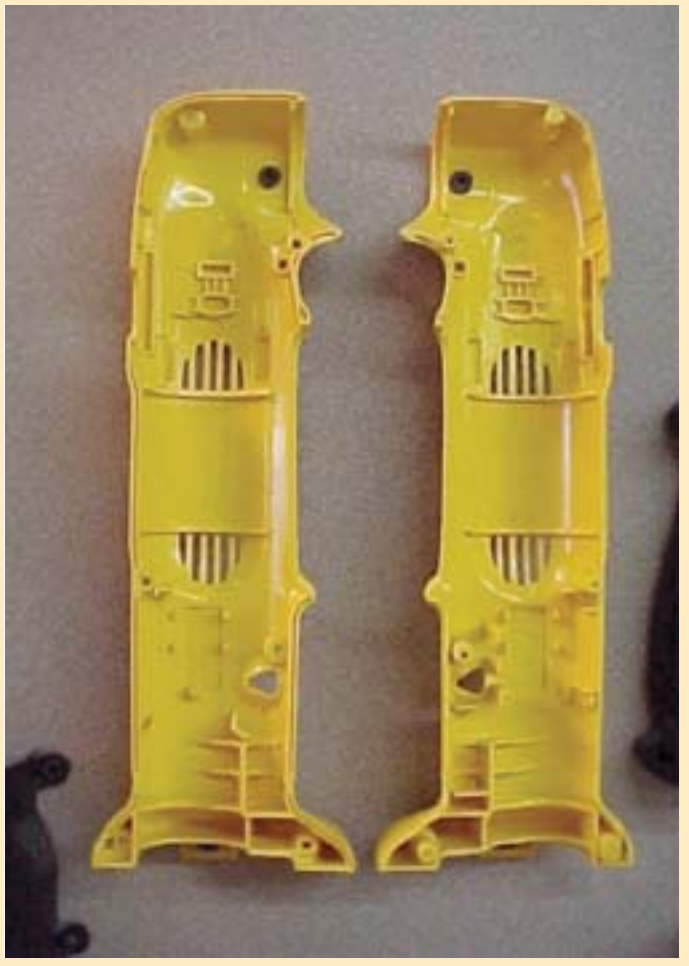
Prototype hand tool clam shell design.