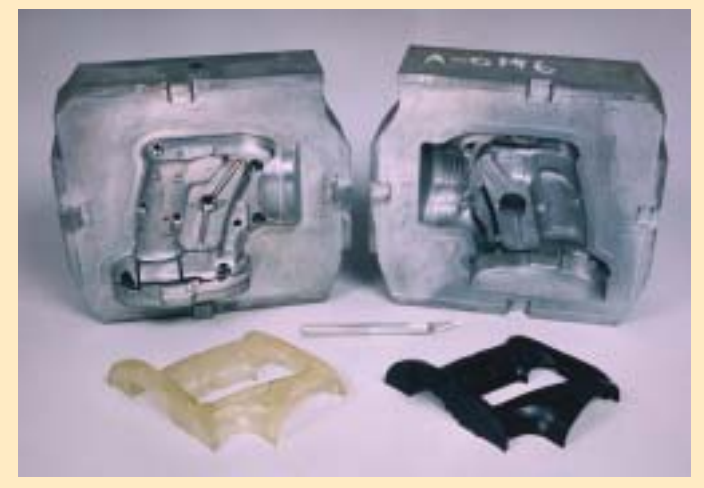
Thermoplastic hand tool prototype with SLA master and cast kirksite cavity.