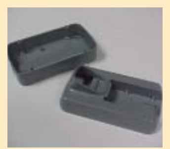
Raw parts from cast kirksite mold set.